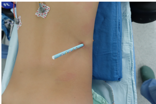
FIGURE 1. A-10-year old girl with a pencil stab wound in the back.

lateral intubation, she inserted the tube successfully on the first attempt (Supplemental Digital Content, Video 1).